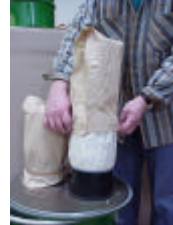
Paper filter removal