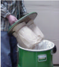
Vacuum head removal

The paper bag must be changed regularly to avoid clogging and consequent overheating and damage to the motor, the replacement of these bags is entirely dependant on the soiling being collected, a good indicator of replacement is when a fine layer of dust is present on the filter bag or in the absence of any visible indicators every 2 or 3 bag empties. This is particularly important when fine materials such as flour, soot, fine wood dust etc. are being handled. The motor must not be started without checking the cloth and paper filter bags are in position and clean. Replacements are available from Camvac at the above address.