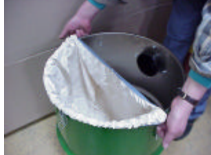
Drum filter removal