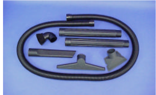
2.5" Full tool kit