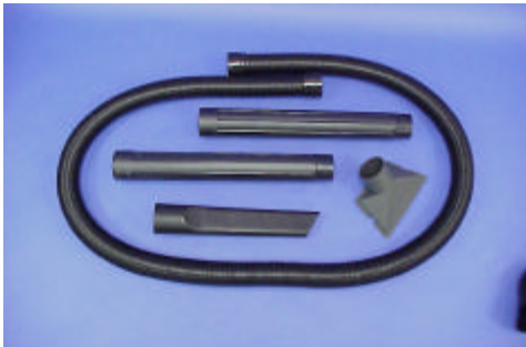
2.5" Standard tool kit

The following parts are contained in the carton: - 1 x Camvac 286W Vacuum, 1 x Wall Mounting Bracket and, if ordered, 1 x 2.5" Standard Tool Kit (includes 1 x 2.5" diameter x 2.5m Long Flexible Hose, 1 x Extension Tubes (pair), 1 x Utility Nozzle (square tool) and 1x Crevice Tool. A 2.5" Full tool kit comprises of a 2.5" standard tool kit plus 1 x 2.5" floor tool and 1 x 2.5" round dusting brush.