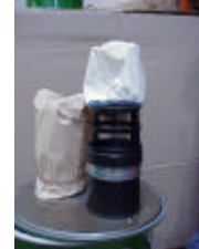
Motor filter removal

Reverse removal procedure to install (unit depicted is a multi motor machine )