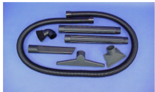
2.5" Full tool kit