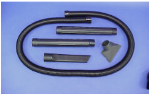
2.5" Standard tool kit

The following parts are contained in the carton: - 1 x Camvac 286W Vacuum, 1 x Wall Mounting Bracket and, if ordered, 1 x 2.5" Standard Tool Kit (includes 1 x 2.5" diameter x 2.5m Long Flexible Hose, 1 x Extension Tubes (pair), 1 x Utility Nozzle (square tool) and 1x Crevice Tool. A 2.5" Full tool kit comprises of a 2.5" standard tool kit plus 1 x 2.5" floor tool and 1 x 2.5" round dusting brush.